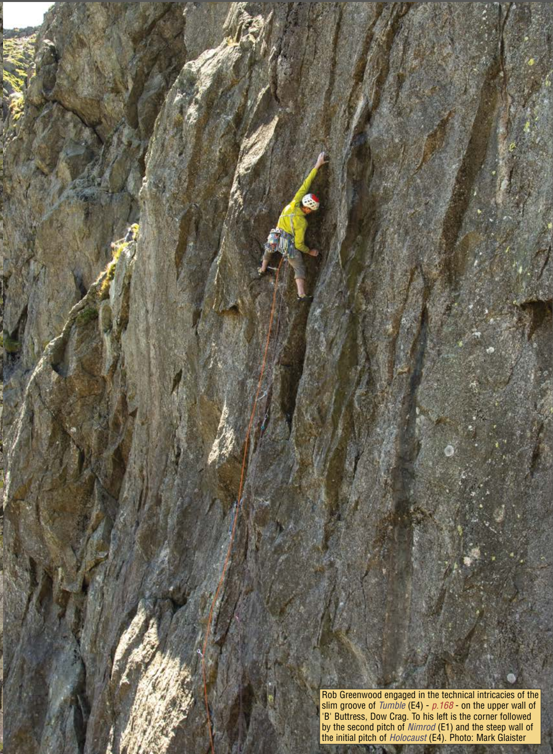
Rob Greenwood engaged in the technical intricacies of the slim groove of Tumble (E4) - p.168 - on the upper wall of 'B' Buttress, Dow Crag. To his left is the corner followed by the second pitch of Nimrod (E1) and the steep wall of the initial pitch of Holocaust (E4).

A very traditional climb that takes the eye-catching right-angled corner-crack at the back of the amphitheatre. Although described in three pitches, it can be led in one by the confident and/or those with a big rack. Start at the base of the corner. 1) 4a, 14m. Take the crack to a belay on a ledge on the left level with the base of the Africa-shaped flake. 2) 4b, 11m. The next section of the crack is more difficult and leads to a belay on ledges - The Bandstand. 3) 4a, 25m. Continue up the crack to the top. Scramble up the gully to where you can walk leftwards. FA. C.Hopkinson, O.Koecher 14.4.1895