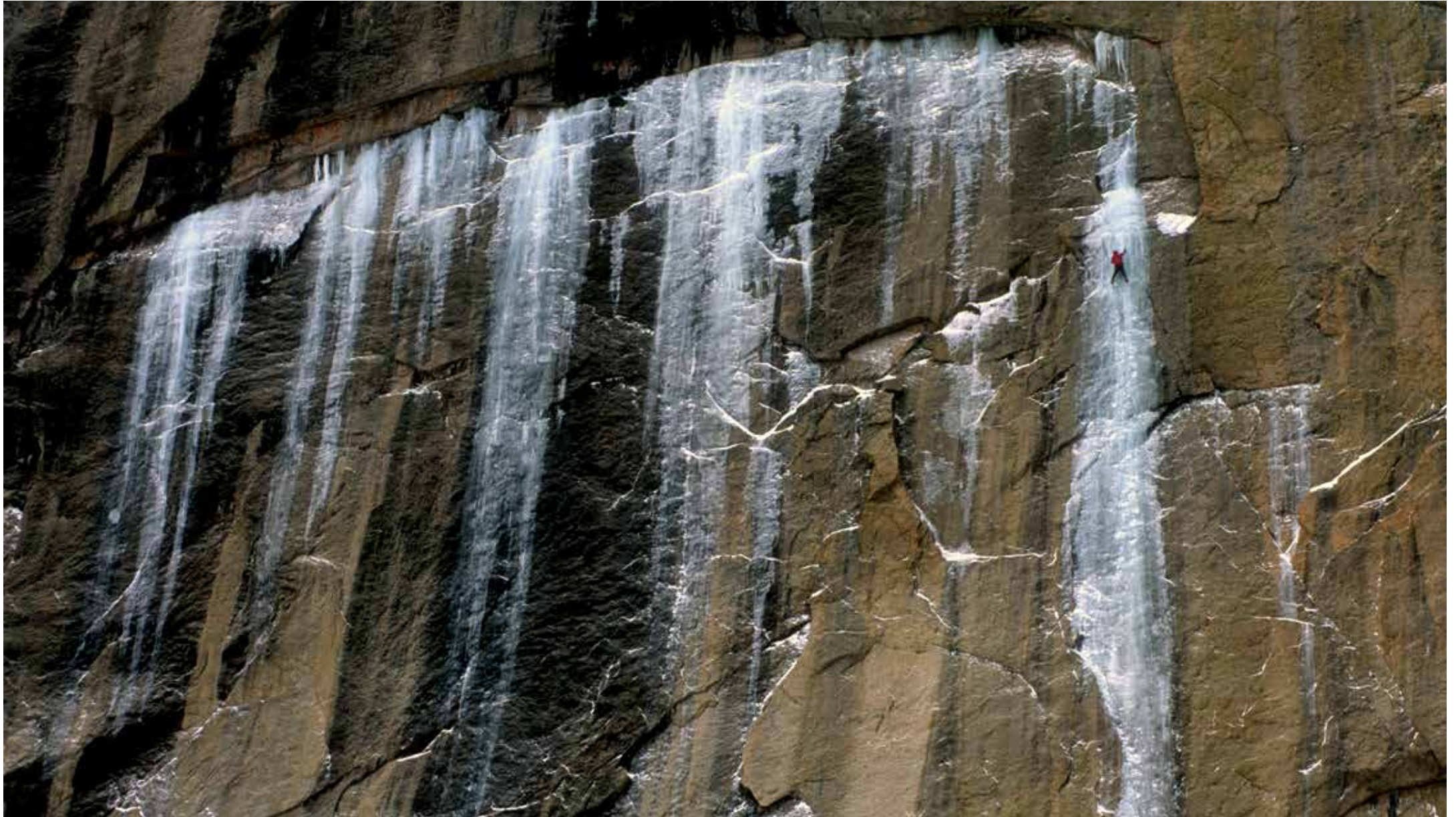
Tom Dickey on Crazy Train , WI5 M7, p90.