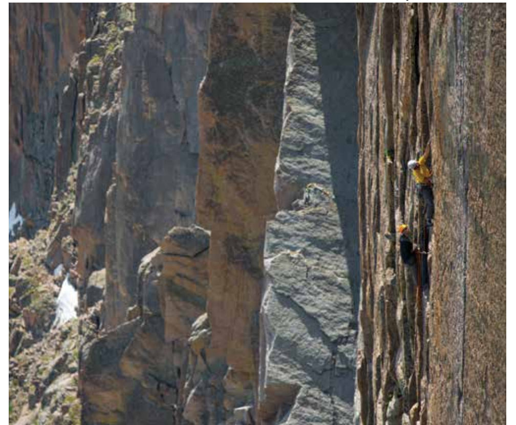
Climbers on Yellow Wall, 5.11b R, p130.

Rack to #4 with doubles from #1 - #3 Camalot, nuts