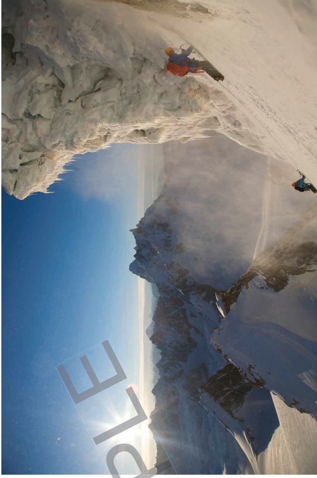
Guido Rill and Hubertus Moschler look out off edge of dome on Mönch. It's not one of my first ever NNT, but it's one of the most spectacular to shoot.